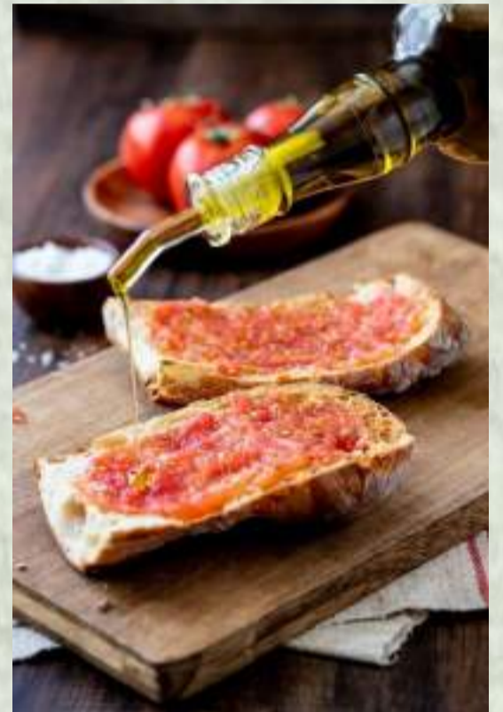
Pan con tomate